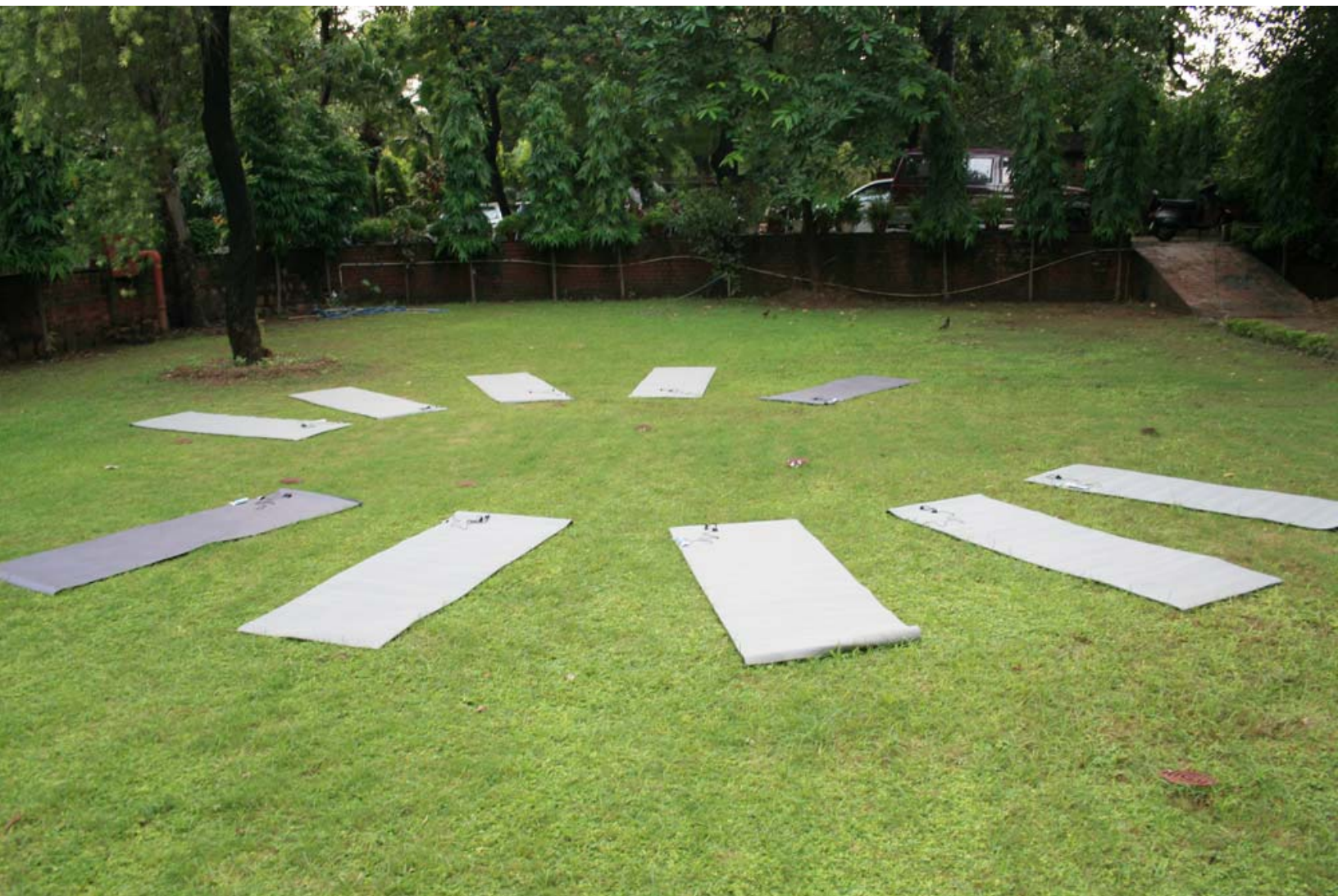
We are Starstuff , installation at Sarai August 2010 2 audio vignettes, 10 yoga mats, 10 Mp3 players

We talked about the history of 'observation' and how it evolved from cult like beginnings to become a recognized form of science. How Astronomy is unique by virtue of being the oldest of the observational sciences and because of all the scientific fields, there will always be a need for the amateur simply because there aren't enough people looking at the stars. What it requires of the imagination and the psyche to deal with a deep time science, spanning thousands of years. Astronomy as a form of archaeology. The position of the 'amateur'. The schizophrenic juxtaposition of the virtual versus the real and the anxieties and false expectations that produces.