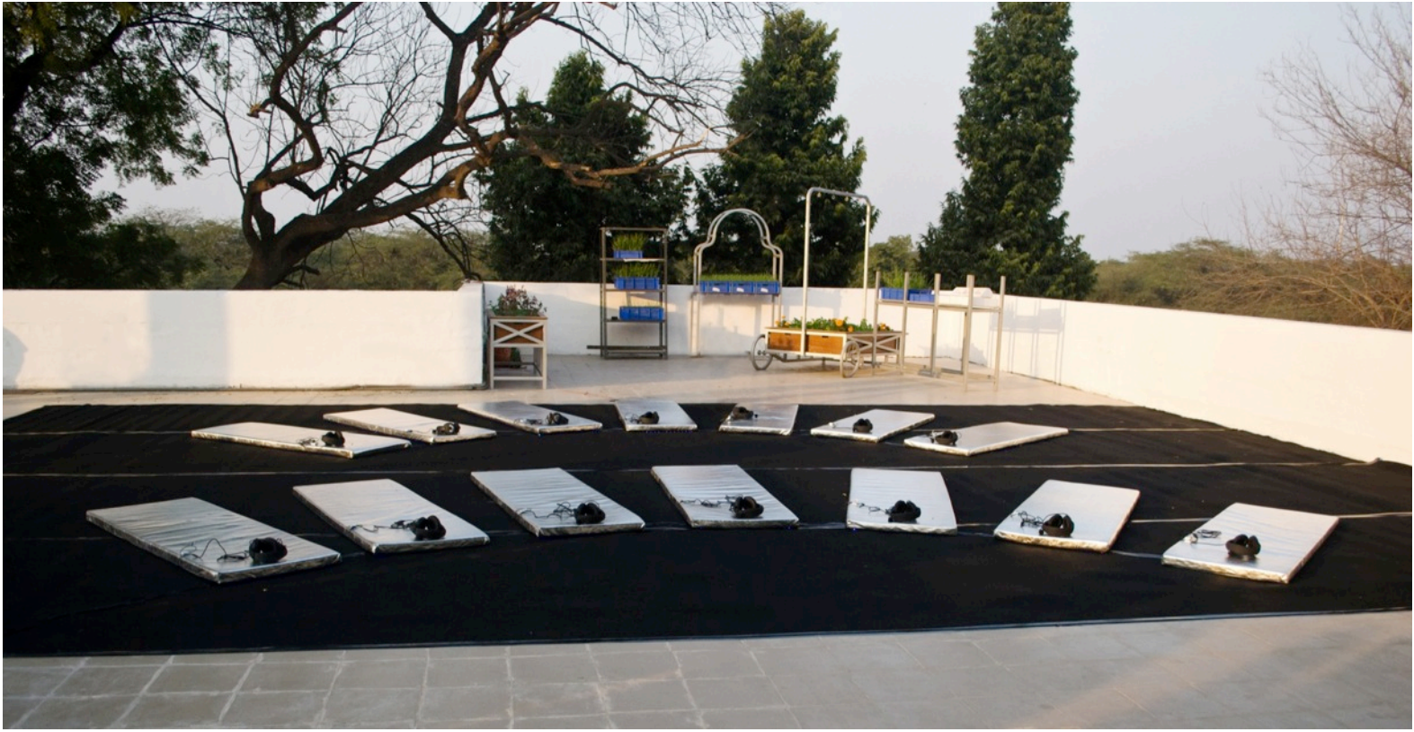
Shadow Walkers / installation at KHOJLIVE12, January 2012 | 1 audio vignette | duration 16 mins | 14 mats | 14 Mp3 players