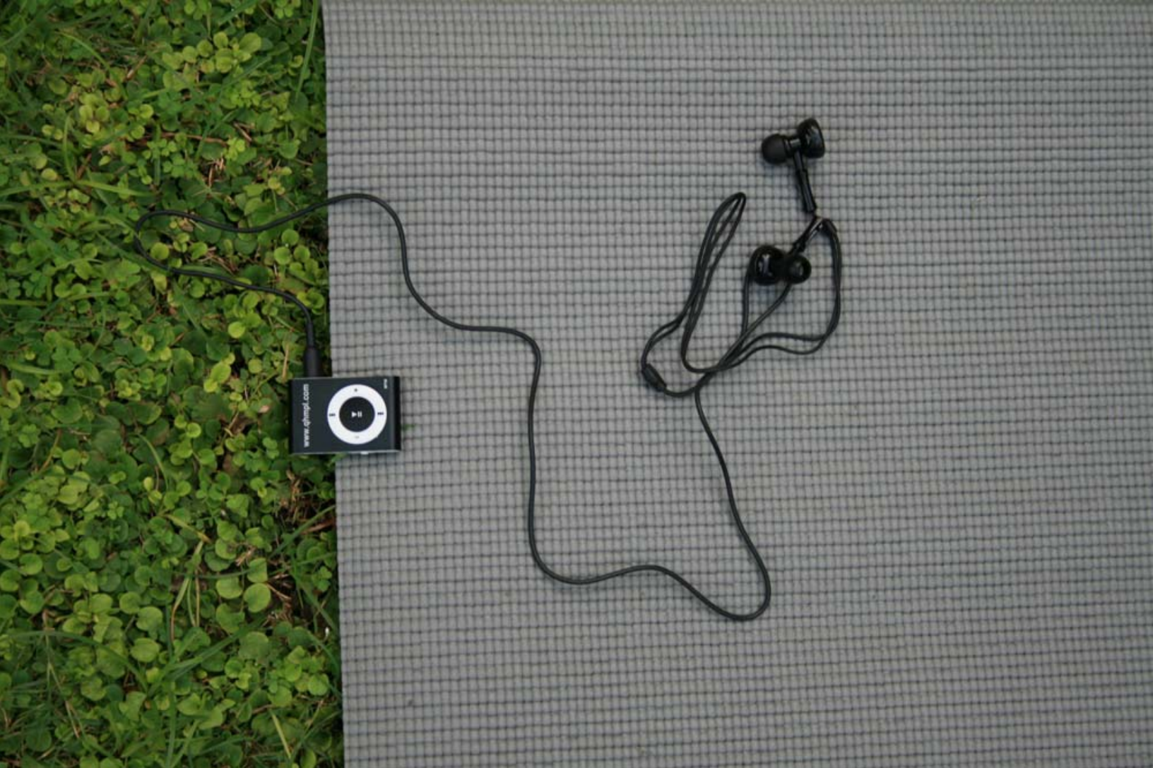
We are Starstuff, (detail)

For the Sarai City-as-studio open day I put together 2 audio pieces, Eclipse and Cathexis , both 10 minutes long, both strung together from the various conversations. The audio pieces were played on 10 MP3 players arranged in the garden outside Sarai. People were invited to lie down in the garden, under the sky and listen to them.