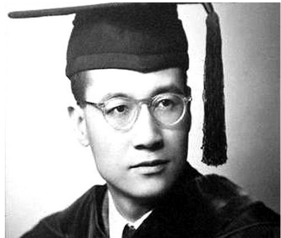
Figure 4: Ye Duzheng, photo in Guangming Daily (光明日报) (circa 1940).

The next generation of Chinese climate scientists developed the global modelling system in the 1990s. They emphasized the importance of understanding the global climate system and became intensely engaged in the international awakening to the prospects of future climate change. The foremost intellectual leader of this new generation was the atmospheric physicist Ye Duzheng (1916–2013), who graduated from Tsinghua University in 1940 and, in 1945, left to do his postgraduate studies in the US. He returned to China in 1950 after earning a PhD in atmospheric physics under the supervision of a leading climate scholar Carl-Gustaf Rossby at the University of Chicago in 1948.