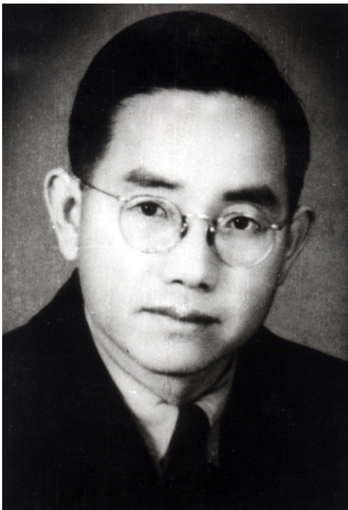
Figure 3: Tu Changwang, photo in Keji Rensheng (科技人生) (before 1962). https://commons.wikimedia.org/wiki/File:%E6%B6%82%E9%95%BF%E6%9C%9B.jpg .

Another scientist who shared this view of China's climate as being related to global long-term cycles and a recent warming trend was Tu Changwang (1906-1962). Tu, at the request of Zhu Kezhen, returned to China from studying in the UK in the 1930s and became a leading figure in Chinese meteorological research. In a particularly noteworthy article in the People's Daily in January 1961 entitled "On the issue of climate change in the twentieth century" (关于二十世纪气候变暖的问题), Tu underscored the fact that international meteorologists had calculated that the annual average temperature of the earth rose by 0.33 degrees between 1910 and 1940. He subsequently issued an early warning to the leadership about the risk of potential negative effects of continued climate change. 7 In many respects, Tu Changwang became one of the most influential scientists in the field through his mentoring of a group of meteorologists and atmospheric physicists that became a core of the climate science community in China in the late twentieth century. 8 Both Tu Changwang and Zhu Kezhen pioneered the establishment of meteorological